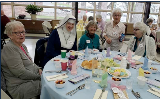
Below: Sisters enjoying fellowship with each other.