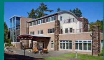
Archbishop Brunett Retreat Center at the Palisades 4700 SW Dash Point Rd. Federal Way, WA